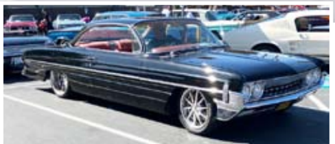
'61 S-88 Gil Zamora