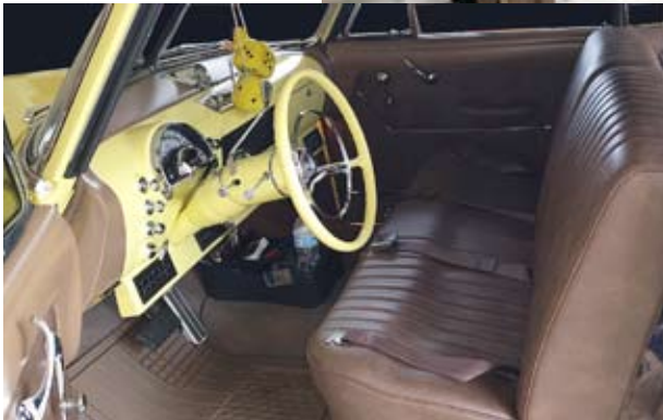
Left, the interior finished up with Vintage Air below dash, tilt coulumn with reduced diameter '57 Chevrolet wheel power assisted and column shifting the 700R4 transmission. Instrument cluster is a Dakota replica. Seats are tastefully redone in brown leather with matching door panels. Note the swing pedals.