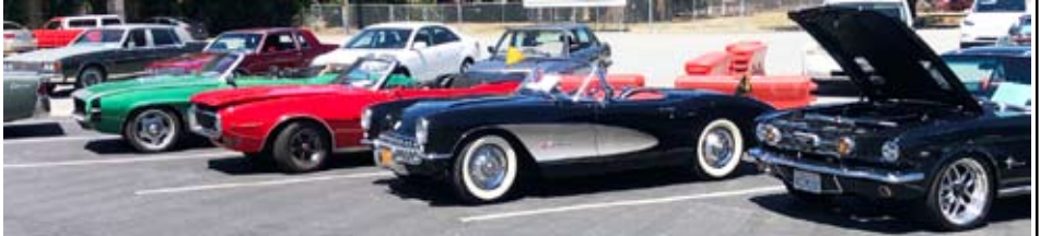
3 Corvettes came including this '57 Fuel Injected of Dick Modzelesky. That's Spiders '66 Mustang above.