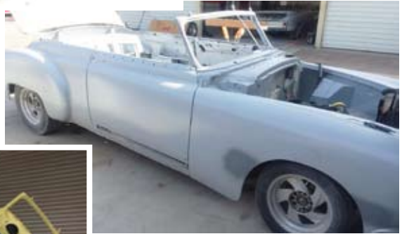
Above body stripped of all hardware and in primer and showing metal work to be done on lower door (S).