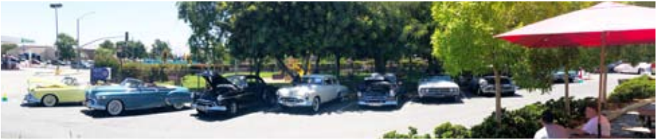
Five Futuramic's started the Olds lineup that totaled 19 cars ending with the Cutlass row below