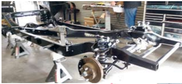
Left: Camaro front clip on Olds frame for disk brakes on the front with rack and pinion steering. The rear end is a S10, rebuilt with 3.73 gears with rear power brakes. Not shown is the 350 c.i. crate GM engine with a 700R4 transmission and 4 barrel Edelbrock carburetor.