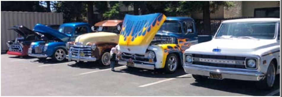
'57 Chevy-Jeff Koski, '40 Ford-Vic Steward, '51 Chevy-Bill Sandoval, '56 Ford-Wally Wallace. '70-Ewing