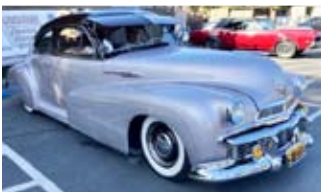
'42 Club Sedan - Antioio Trejo